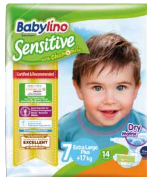
No 7 Extra Large+ 17+ kg