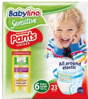
No6 15+ kg