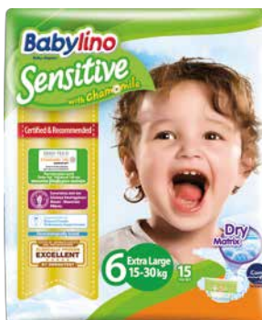
No 6 Extra Large 15-30 kg