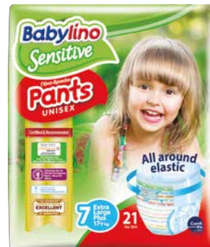
No7 17+ kg