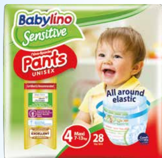
No4 7-13 kg