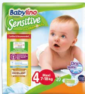
No 4 Maxi 7-18 kg