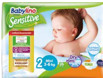
No 2 Mini 3-6 kg