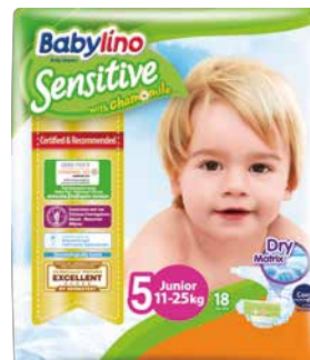
No 5 Junior 11-25 kg