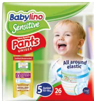
No5 10-16 kg