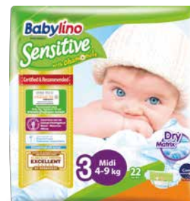
No 3 Midi 4-9 kg