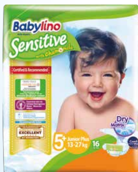
No 5+ Junior+ 13-27 kg