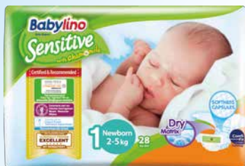
No 1 Newborn 2-5 kg