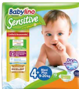
No 4+ Maxi+ 9-20 kg